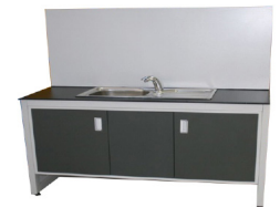
Removable counter and sink

Black frame, grey vinyl Complies to Australian standards.