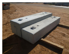
Cyclonic Tie downs

High air flow for better clothes care. Front access for easier self service.