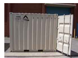
General purpose container

5,000L Skid mounted water tank complete with pump for areas where connection to services is not available.