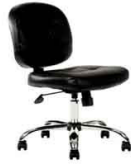
Leather clerical chair

1,500mm x 750mm Functional, flexible and well designed.