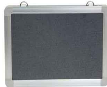
Grey fabric pin board

1200mm x 900mm Magnetic. Stain and scratch resistant.