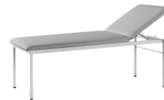
First aid examination bed

1200mm x 900mm Ideal for common areas to display staff memos, news and photos.