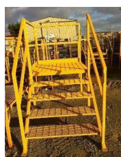
Steps and Landing

Manufactured in Australia from high quality materials with ultra violet protection to ensure long lasting and durable cabinets. Sewer connect or tank mounted options available.