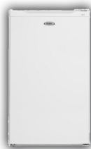
113L Bar fridge

1,612 x 595 x 638mm Unique multi-directional air flow system that ensures even cooling for optimum food storage.