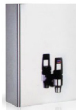
5L hot water unit

20 Litre 455 x 252 x 320mm Complete with i-wave technology to microwave and reheat evenly.