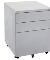
Mobile pedestal 3 drawer unit

Easy to clean. Modern, stylish and stackable.