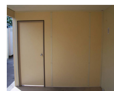
Removable Partition wall

2 or 3 tonne. Engineered cyclonic tie down blocks for security in cyclonic areas.