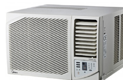
Reverse cycle air conditioner

Compliant to AS/NZS 3813. Lightweight & stackable chair rated to 180kg.