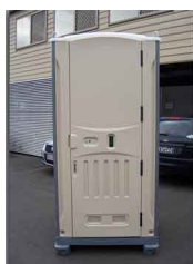
Fresh Water Flush Toilet

Three metre wall sections. Enables the creation of offices.