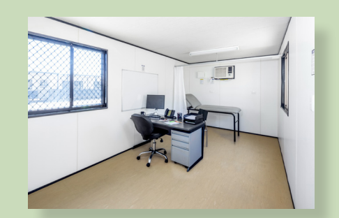
Furnished First Aid Room

To enhance your modular building experience, please contact your local Ausco representative for information about our 360° Solutions range of additional products and services.