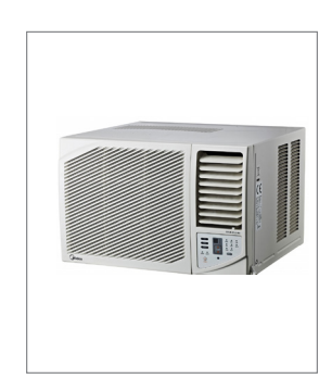
Reverse Cycle AC