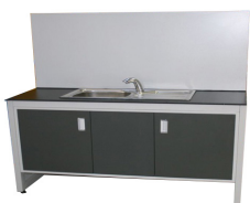
Counter Sink (Cold Water)