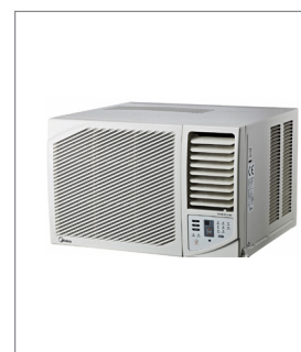
Reverse Cycle AC