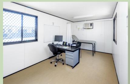
Furnished First Aid Room

To enhance your modular building experience, please contact your local Ausco representative for information about our 360° Solutions range of additional products and services.