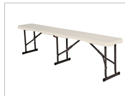
Bench Seat Bi Fold

Ask us about our furnished building kits to cover your project needs.