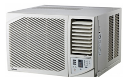
Reverse Cycle AC

Ask us about additional items to cover your office needs.