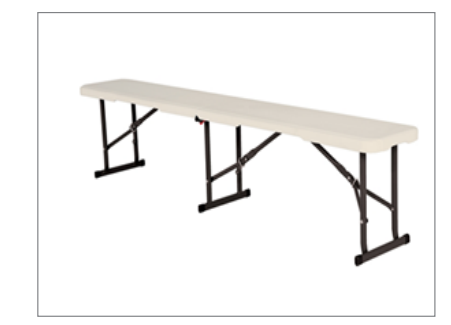
Bench Seat Bi Fold