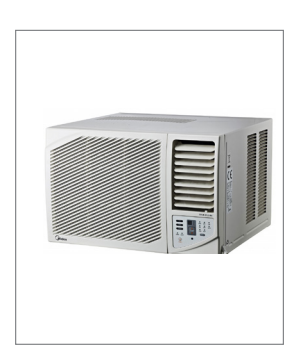
Reverse Cycle AC