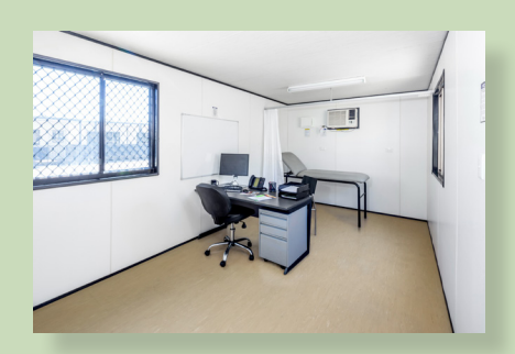
Furnished First Aid Room

To enhance your modular building experience, please contact your local Ausco representative for information about our 360° Solutions range of additional products and services.