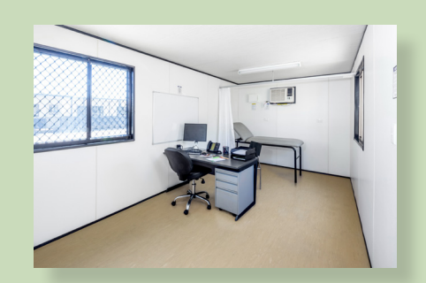
Furnished First Aid Room

To enhance your modular building experience, please contact your local Ausco representative for information about our 360° Solutions range of additional products and services.