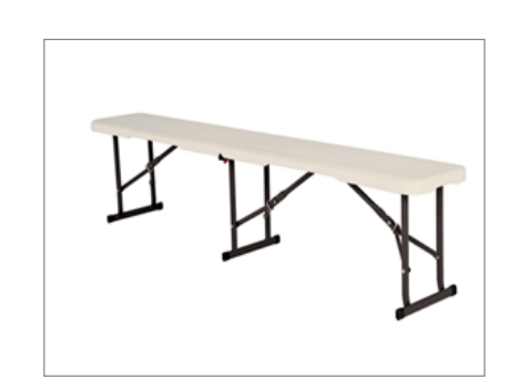
Bench Seat Bi Fold