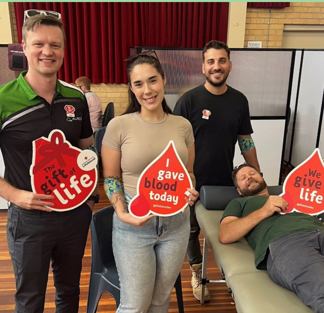
Our Melbourne team giving blood!

Volunteering is a key feature of our sustainability strategy as it is a simple and effective way to contribute to our communities. Through our volunteering we have planted trees, collected rubbish, supported the Garbutt Magpies plus much more.