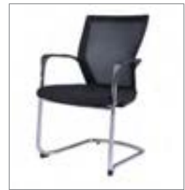
Code: COMF CHAIR VISITOR