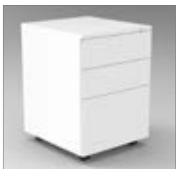
Code: ESS PEDESTAL MOBILE

3 Drawer Steel Mobile Pedestal 610x460x475mm