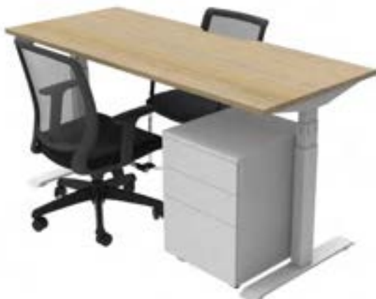
Pack Code: Comf Height Adj Office Pack