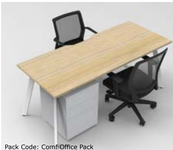
Pack Code: Comf Office Pack