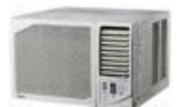
Reverse Cycle AC

Ask us about additional items to cover your office needs.