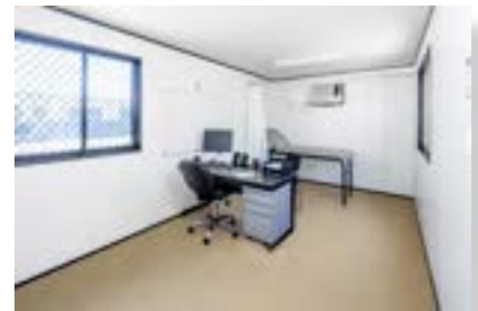
Furnished First Aid Room

To enhance your modular building experience, please contact your local Ausco representative for information about our 360° Solutions range of additional products and services.