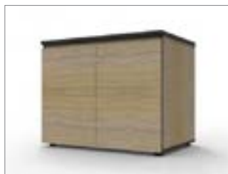
Code: ESS CREDENZA

3 Drawer Steel Mobile Pedestal 610x460x475mm