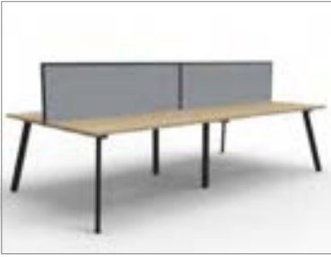
Code: COMF POD 4 PERSON

Double Sided Workstation POD with Screens 3600x1530mm