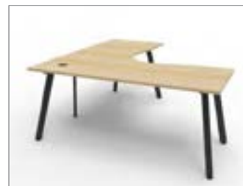
Code: COMF DESK CORNER

Corner Desk White Frame 1800x1800x700x730mm