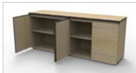
Code: COMF CREDENZA