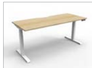
Code: COMF DESK ADJ 1800

Corner Desk White Frame 1800x1800x700x730mm