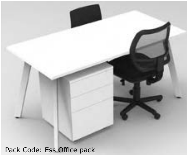
Pack Code: Ess Office pack

Select our Essential or Comfort range office packs for your individual working space including desks, office chairs and lockable storage.