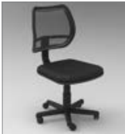
Code: ESS CHAIR OFFICE

If you would like to add extra items to your packs or want to create a customised solution, just select the required items from our furniture list. If the item you need is not in here, let us know and we will find it for you.