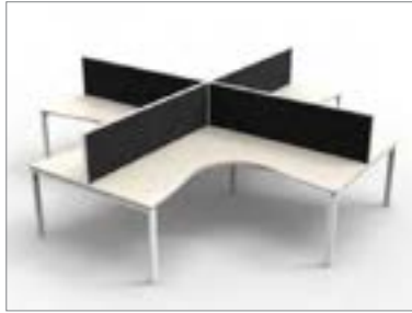
Code: COMF POD CORNER 4 PE

Double Sided Workstation POD with Screens 3600x1530mm