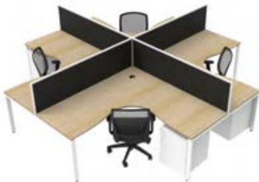
Pack Code: Comf Corner POD Pack