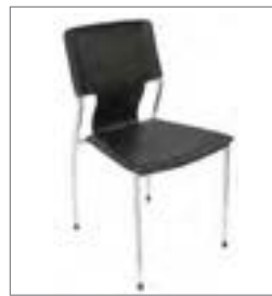
Code: ESS CHAIR VISITOR