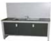
Counter Sink (Cold Water)