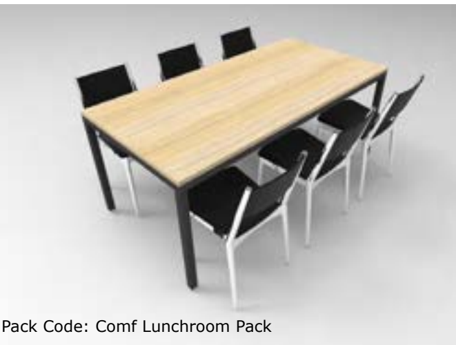
Pack Code: Comf Lunchroom Pack