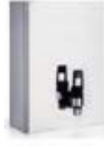
Hot Water Boiler