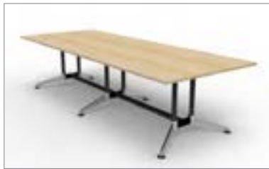
Code: COMF TABLE MEETING