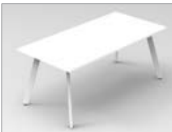
Code: ESS DESK 1500x750