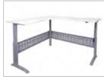
Code: COMF DESK CORNER ADJ

Electric Height Adjustable Corner Workstation 1800x1500x700x685mm