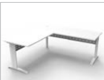
Code: ESS DESK CORNER 1800

Corner Desk White Frame 1800x1800x700x730mm