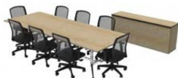
Pack Code: Comf Meeting Room Pack