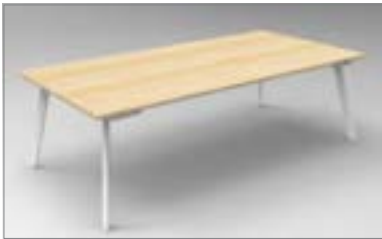
Code: ESS TABLE MEETING