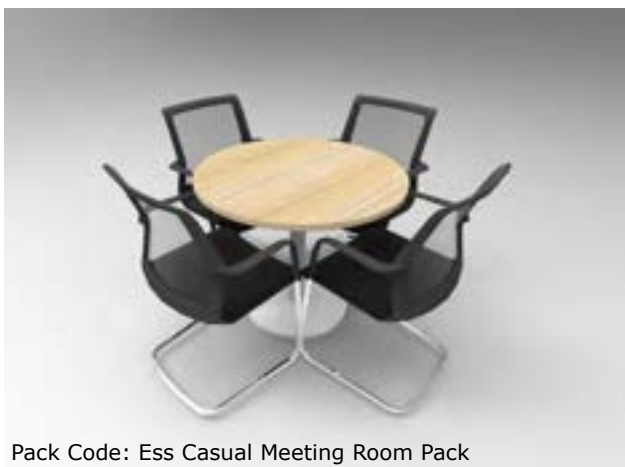
Pack Code: Ess Casual Meeting Room Pack