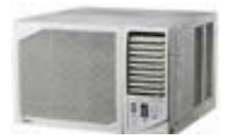
Reverse Cycle AC