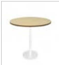
Code: ESS TABLE MEETING RD