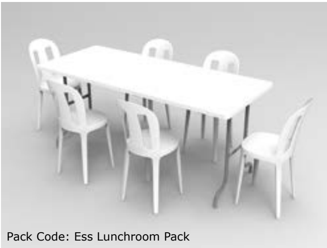
Pack Code: Ess Lunchroom Pack

Provide your team with a functional and comfortable space to enjoy their meal breaks with our range of lunchroom furniture.