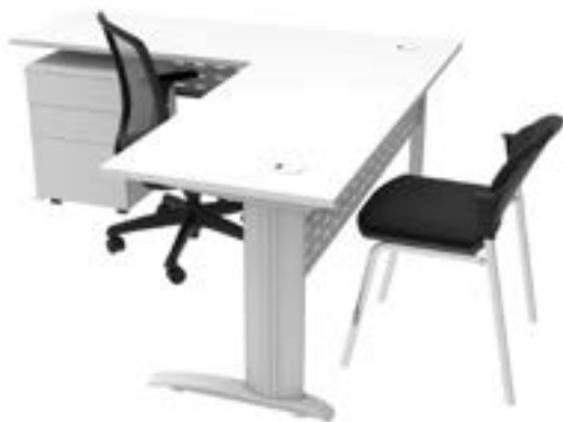
Pack Code: Ess Corner Workstation Pack

Scale up your open plan workspace with our ergonomic workstations complete with desks, chairs and storage. Just add screens and partitions to increase privacy and safety.