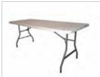
Code: ESS TABLE LUNCHROOM