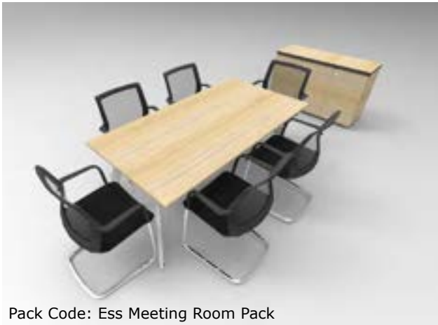
Pack Code: Ess Meeting Room Pack

Create a comfortable, private space on site for your key decision makers, meetings and collaborations with our range of boardroom and meeting room furniture.