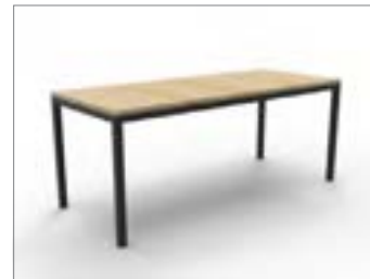
Code: COMF TABLE DINING