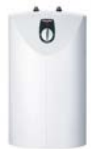
Underbench Hot Water System

* Please note furniture items may vary in appearance from region to region depending on stock availability.