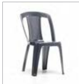
Code: ESS CHAIR OUTDOOR