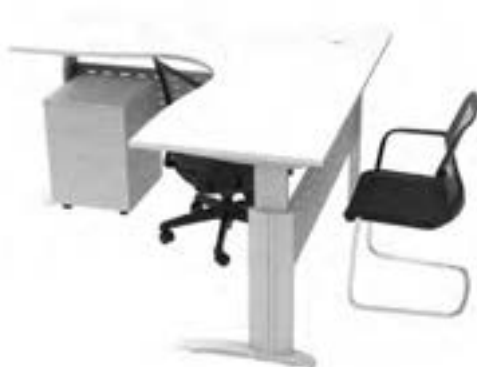
Pack Code: Comf Corner Workstation Height Adj Pack