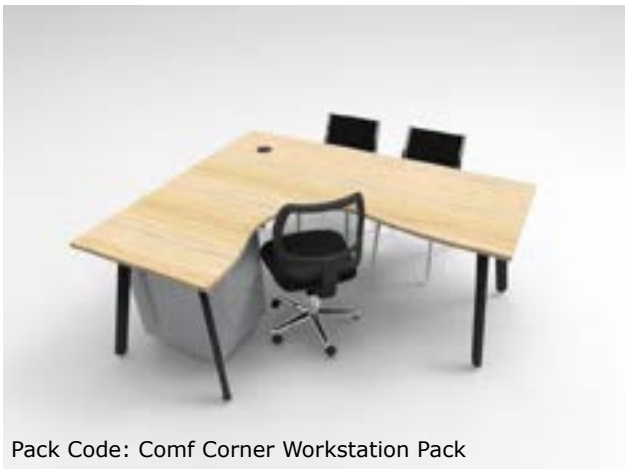
Pack Code: Comf Corner Workstation Pack