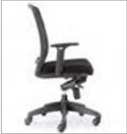
Code: COMF CHAIR OFFICE