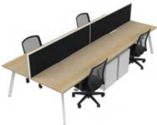
Pack Code: Comf Double Sided POD pack

Enjoy the flexibility and space saving benefits of our lineal and corner PODS.