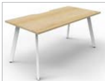
Code: COMF DESK 1800x750