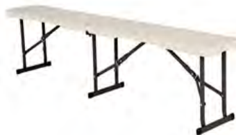
Bench Seat Bi Fold