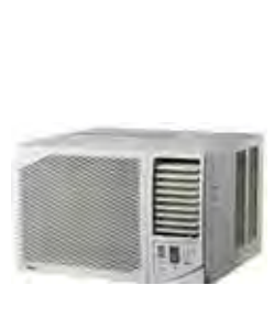
Reverse Cycle AC