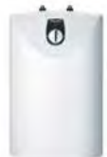
Underbench Hot Water System

* Please note furniture items may vary in appearance from region to region depending on stock availability.