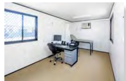
Furnished First Aid Room

Check out more of our product range at ausco.com.au