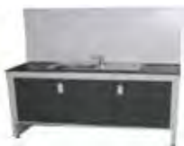
Counter Sink (Cold Water)