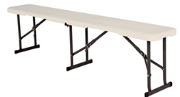
Bench Seat Bi Fold