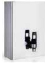
Hot Water Boiler