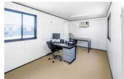
Furnished First Aid Room

Check out more of our product range at ausco.com.au