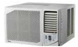
Reverse Cycle AC