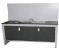
Counter Sink (Cold Water)