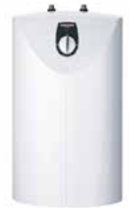
Underbench Hot Water System

* Please note furniture items may vary in appearance from region to region depending on stock availability.