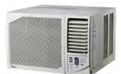
Reverse Cycle AC

Ask us about additional items to cover your office needs.