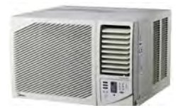
Reverse Cycle AC