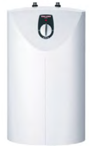
Underbench Hot Water System

* Please note furniture items may vary in appearance from region to region depending on stock availability.