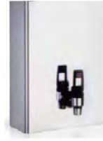
Hot Water Boiler