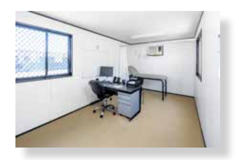
Furnished First Aid Room